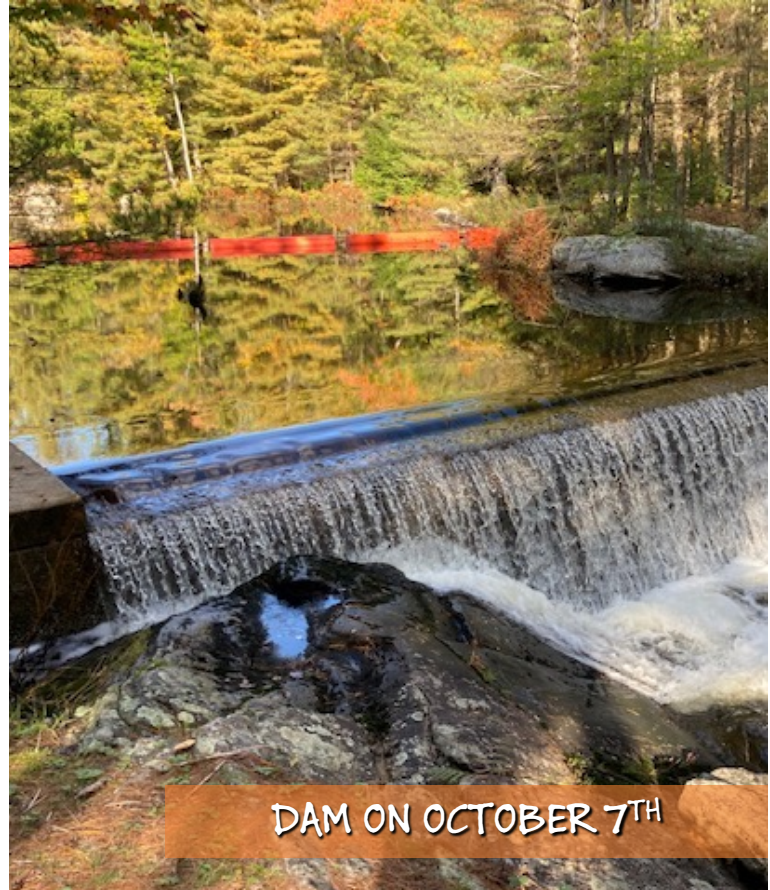
DAM ON OCTOBER 7 TH