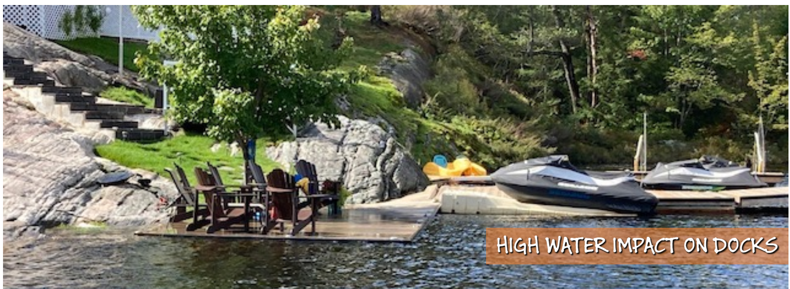
HIGH WATER IMPACT ON DOCKS

Stay Connected: Visit www.healeylake.org for the latest news and updates!