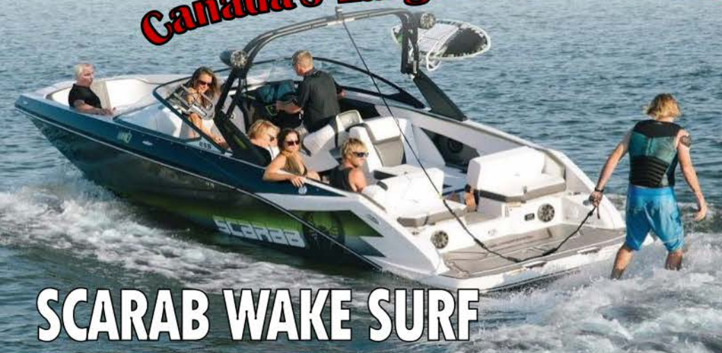
SCARAB WAKE SURF