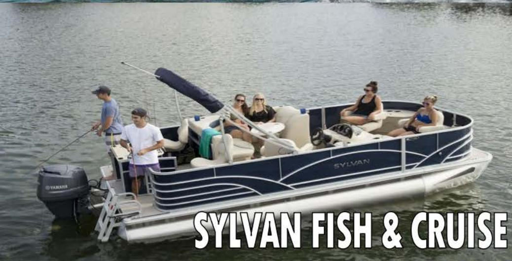
SYLVAN FISH & CRUISE