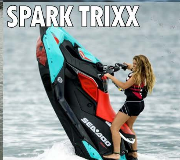
SEADOO SPARK TRIXX