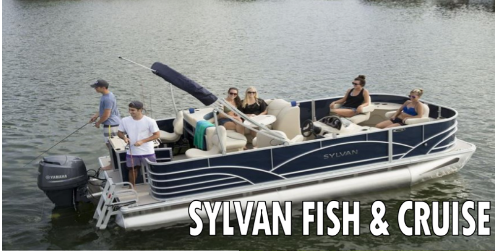
SYLVAN FISH & CRUISE