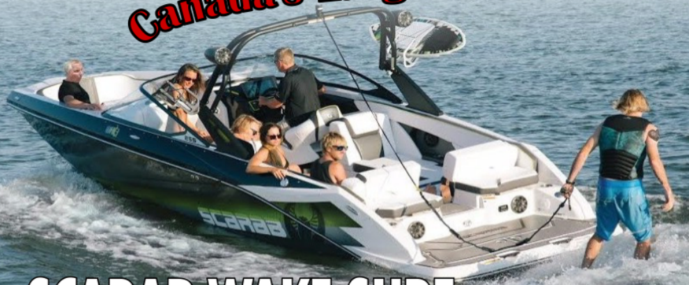
SCARAB WAKE SURF