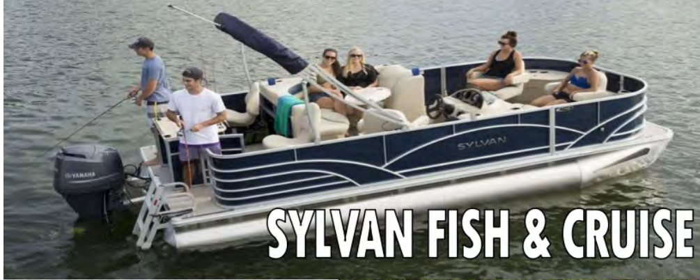
SYLVAN FISH & CRUISE