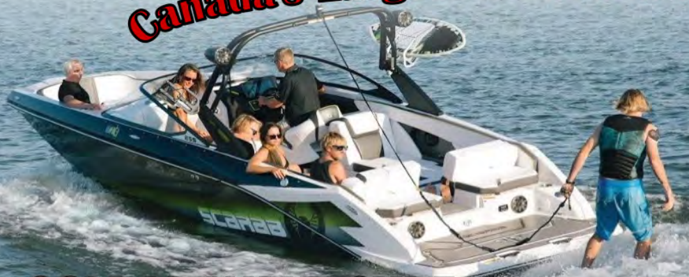
SCARAB WAKE SURF