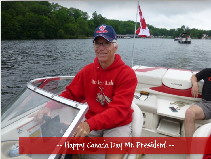
-- Happy Canada Day Mr. President --