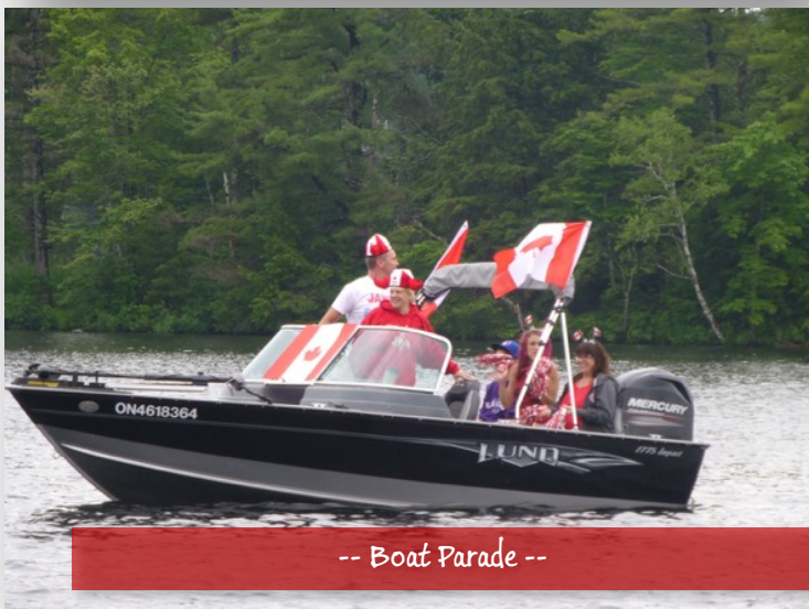
-- Boat Parade --