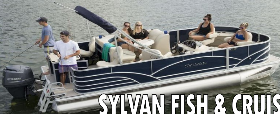
SYLVAN FISH & CRUISE