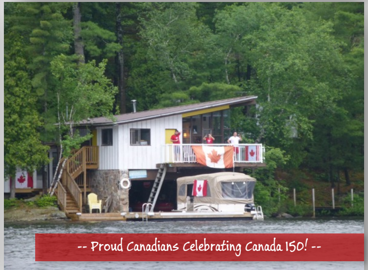
-- Proud Canadians Celebrating Canada 150! --