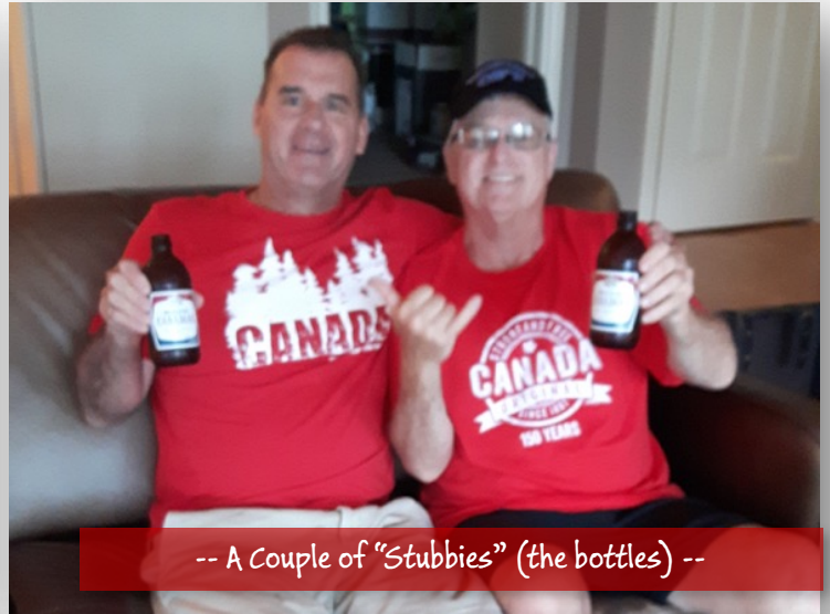
-- A Couple of "Stubbies" (the bottles) --