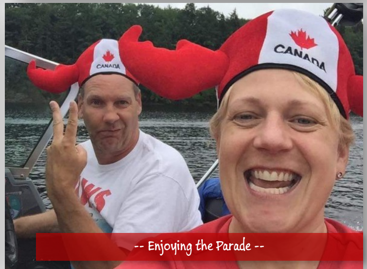
-- Enjoying the Parade --