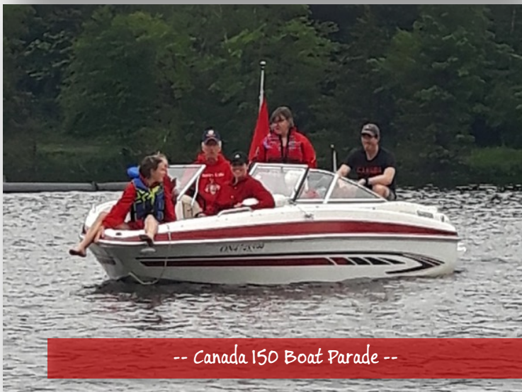
-- Canada 150 Boat Parade --