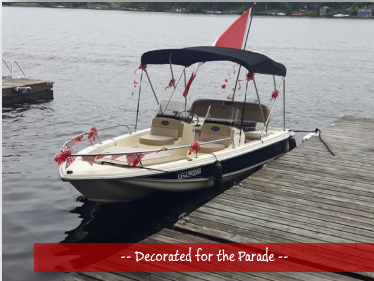
-- Decorated for the Parade --