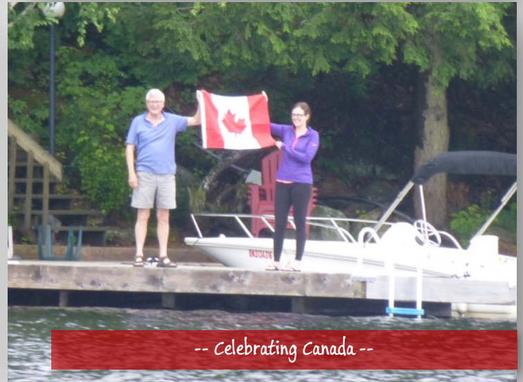
-- Celebrating Canada --