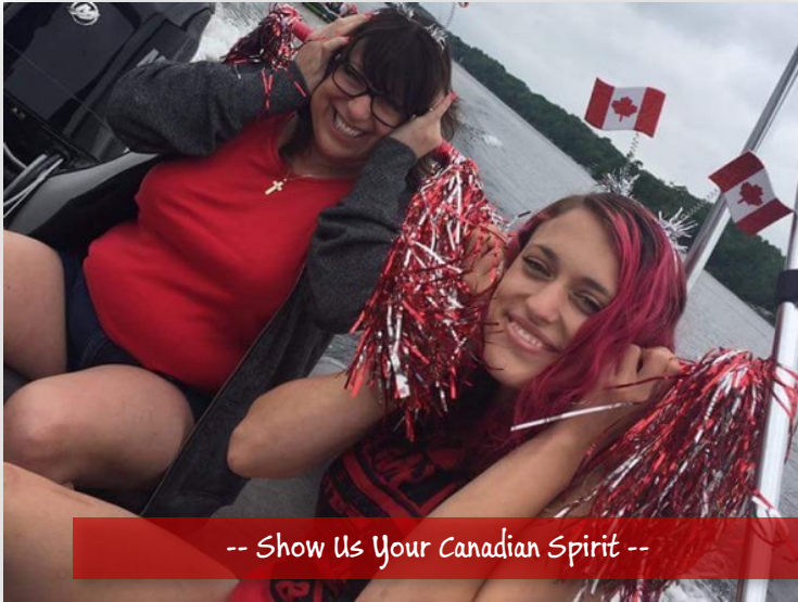
-- Show Us Your Canadian Spirit --

For all those who celebrated Canada's 150 th birthday on Healey Lake this year, it won't come as news that the weather didn't really cooperate – but many true "Healey Lakers" didn't let that stand in the way of making this an epic year of celebrations!