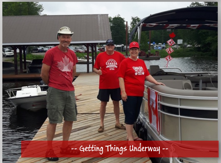
-- Getting Things Underway --