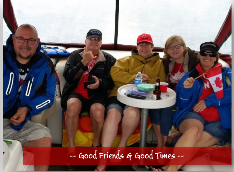
-- Good Friends & Good Times --