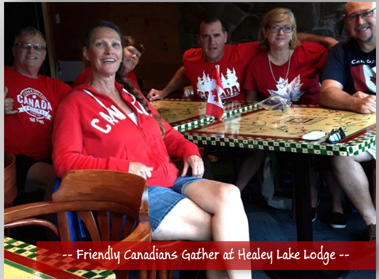
-- Friendly Canadians Gather at Healey Lake Lodge --