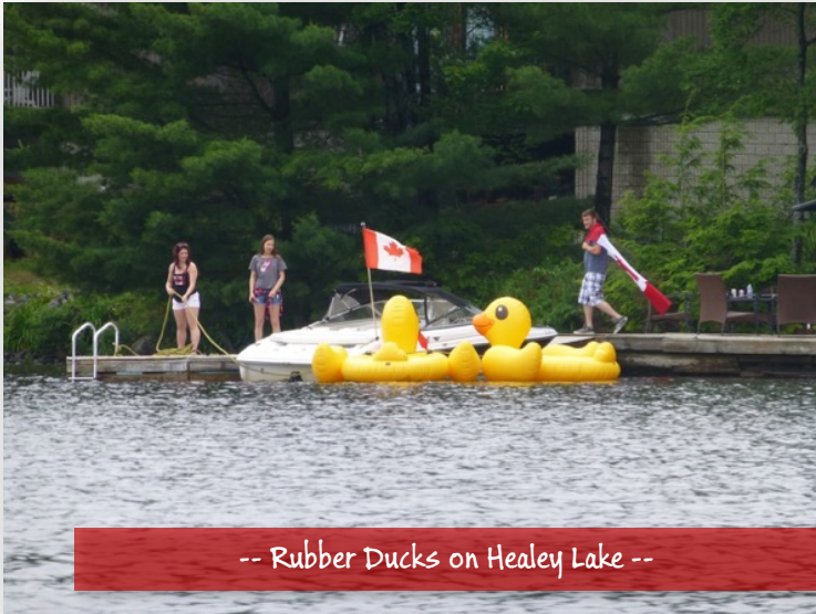
-- Rubber Ducks on Healey Lake --

For all those who celebrated Canada's 150 th birthday on Healey Lake this year, it won't come as news that the weather didn't really cooperate – but many true "Healey Lakers" didn't let that stand in the way of making this an epic year of celebrations!