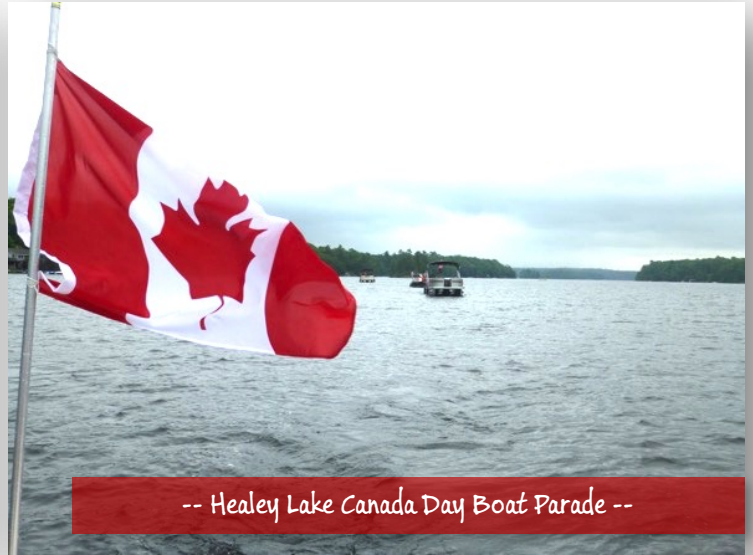
-- Healey Lake Canada Day Boat Parade --