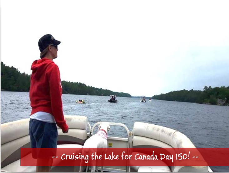
-- Cruising the Lake for Canada Day 150! --

For all those who celebrated Canada's 150 th birthday on Healey Lake this year, it won't come as news that the weather didn't really cooperate – but many true "Healey Lakers" didn't let that stand in the way of making this an epic year of celebrations!