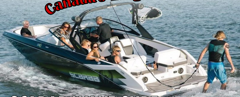
SCARAB WAKE SURF