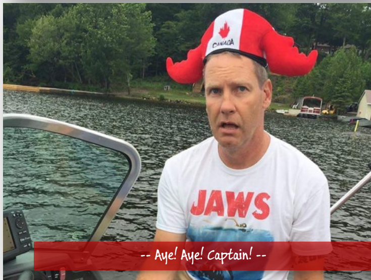
-- Aye! Aye! Captain! --