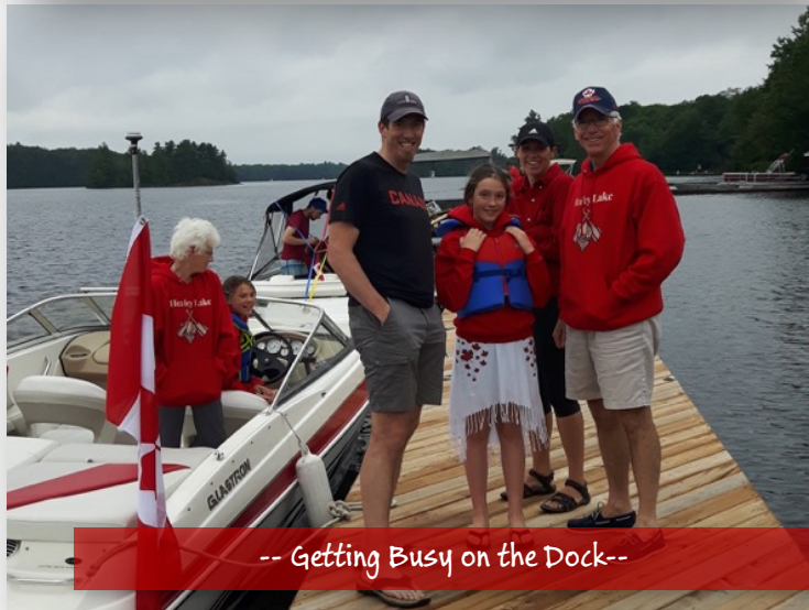
-- Getting Busy on the Dock--